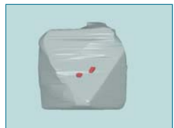
Actual Inclusion Location for Planning

All pictures on the catalogue are for presentation only